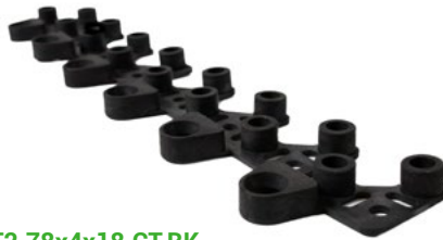
MT2.78x4x18.CT.BK Anti-Fatigue Drainage Mat to MT2 Tile Connector