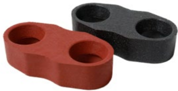
MT2.78x1x3xCT.BK SureLok Connector Black - Mat to Mat Connector

* Sizes are approximate | * Some colors require minimum quantities